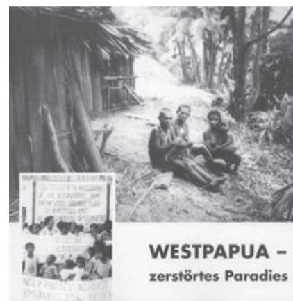
Figure 2: West Papua: destroyed paradise.

The second aspect of a postcolonial view is more concerned with the perpetuation of power inequalities. Pazifik Netzwerk fights nuclear testing in the Pacific, clarifying its consequences, and it strongly opposes the USA's and France's continued exploitation of the Pacific Islands. Exploitation was supported by cultural representations and political influence and control, which Pazifik Netzwerk tries to counteract. The misconception that Pacific nations are small, isolated and insignificant was a big contributor to the efforts of the hegemonic powers to test nuclear weapons in the Pacific. For example, Henry Kissinger, US National Security Advisor 1969, said: