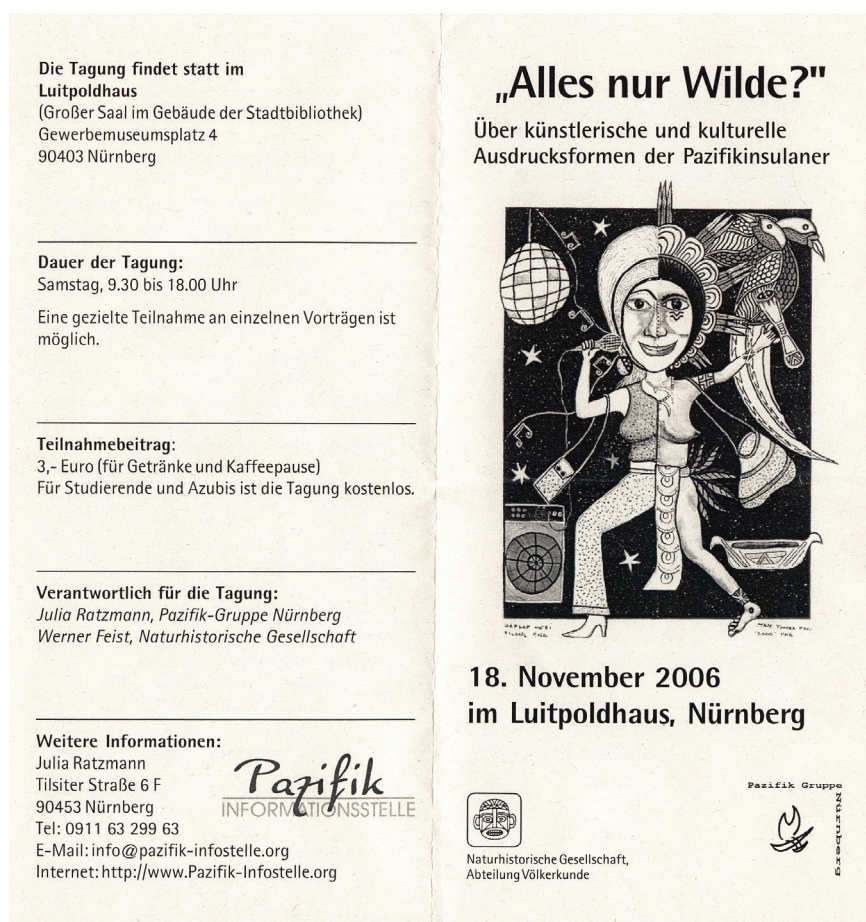
Figure 1: Celebration Publication "All just Savages": 20 years of Pazifik-Netzwerk, 1988-2008.