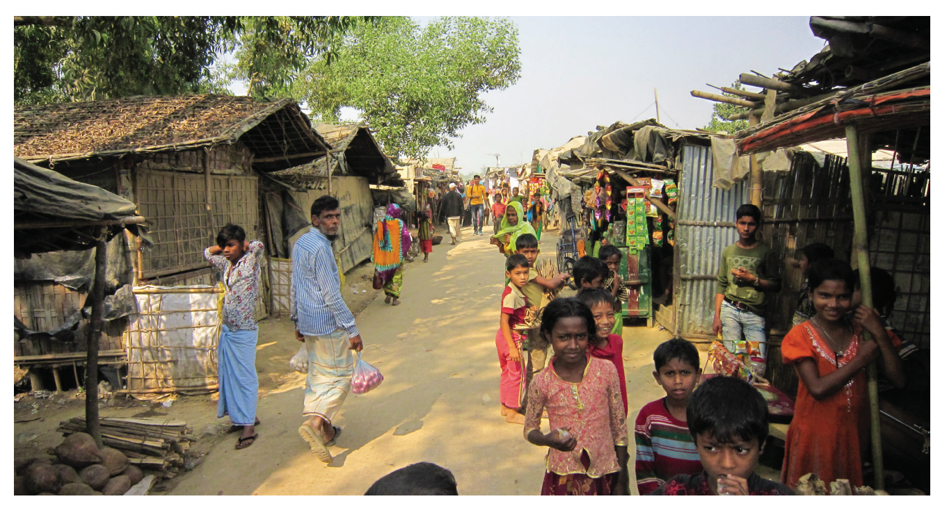
Figure 5: Main "shopping street" in Leda camp

photographs and other documents. The report highlights serious human rights violations in Rakhine since August 2017, demands investigation and prosecution for genocide and crimes against humanity and draws up a list of alleged perpetrators (Human Rights Council 2018).