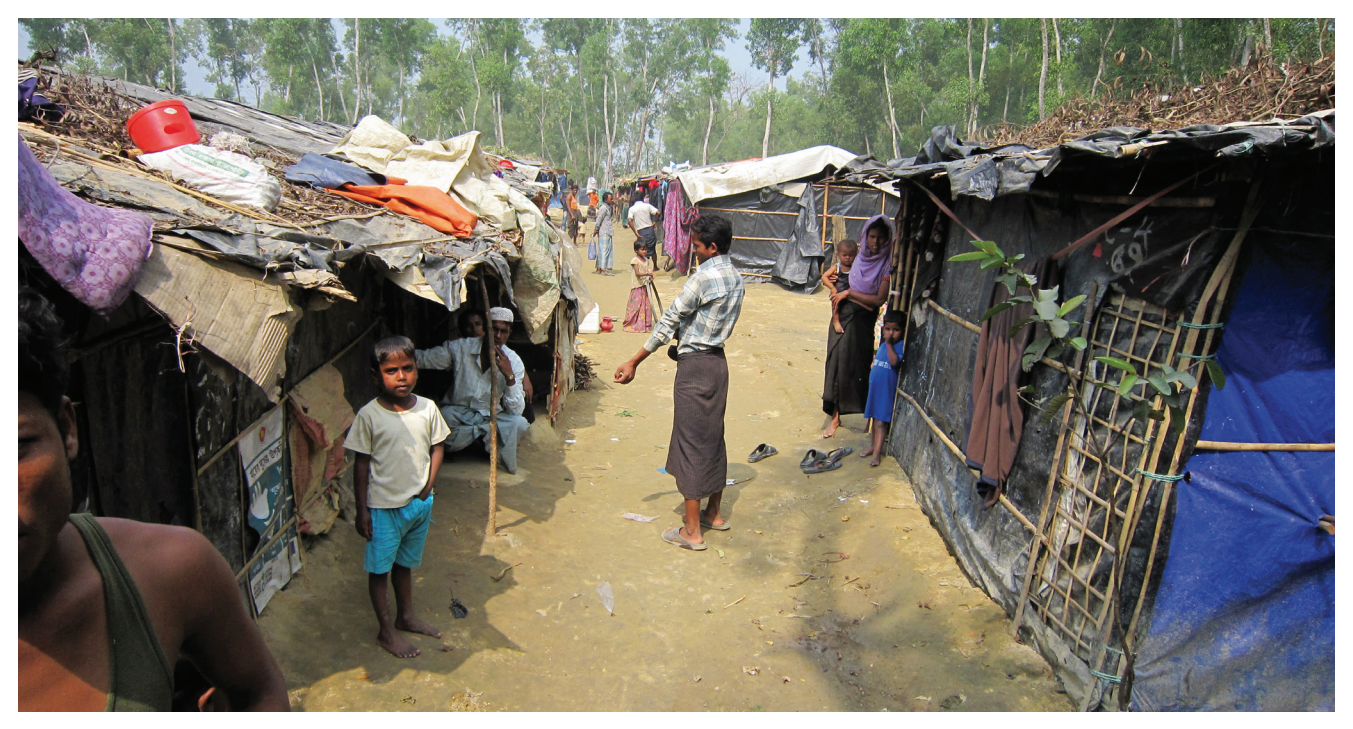
Figure 4: Shelters in Leda camp