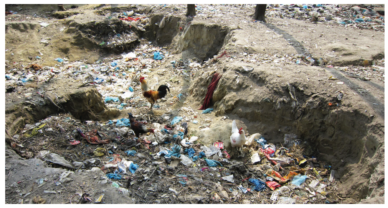
Figure 3: Waste disposal is a problem, Leda Camp

ethnic Burmese in administration positions and abolished protection measures for the minorities. This lead to bloody attacks of the Burmese independence army of Aung San and others. After the end of World War II, Burma was again integrated into the British colonial empire.