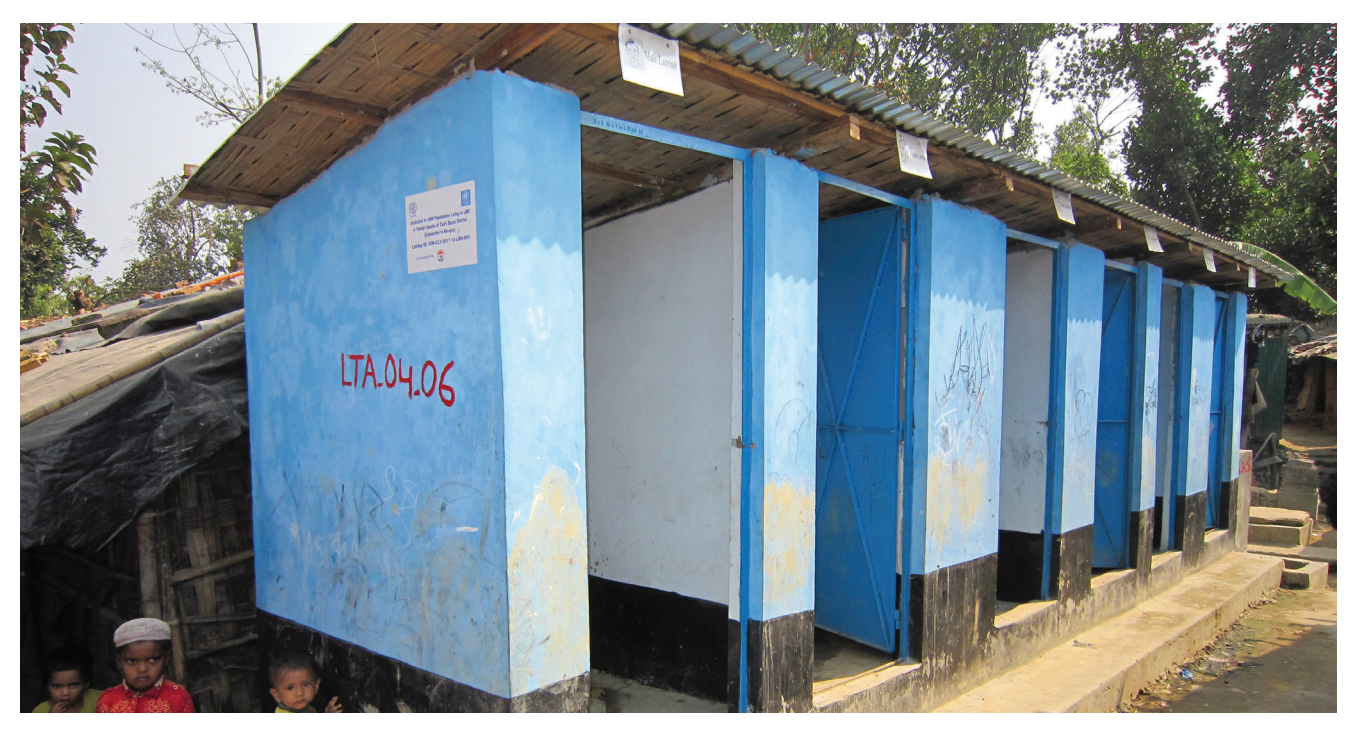
Figure 6: Toilets in Leda camp, provided by international aid project. The toilets are connected to a biogas plant.

for China's energy security. The OBOR project will bring substantial economical advantages, namely by bypassing the security concerns and politically fragile bottleneck in the Strait of Malacca. One pipeline begins in the Bay of Bengal in the Rakhine state. After local protests, Rohingya coastal communities were vacated in 2012 to clear ways for the Kyaukphyu Special Economic Zone (Zoglul 2017).