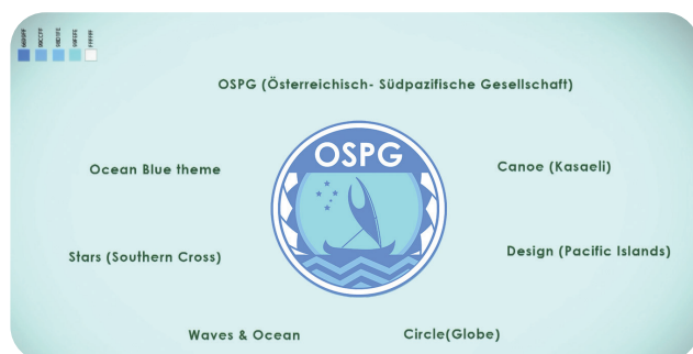
Figure: New logo design process

Do not hesitate to take a look and browse through our new Website: www.ospg.at