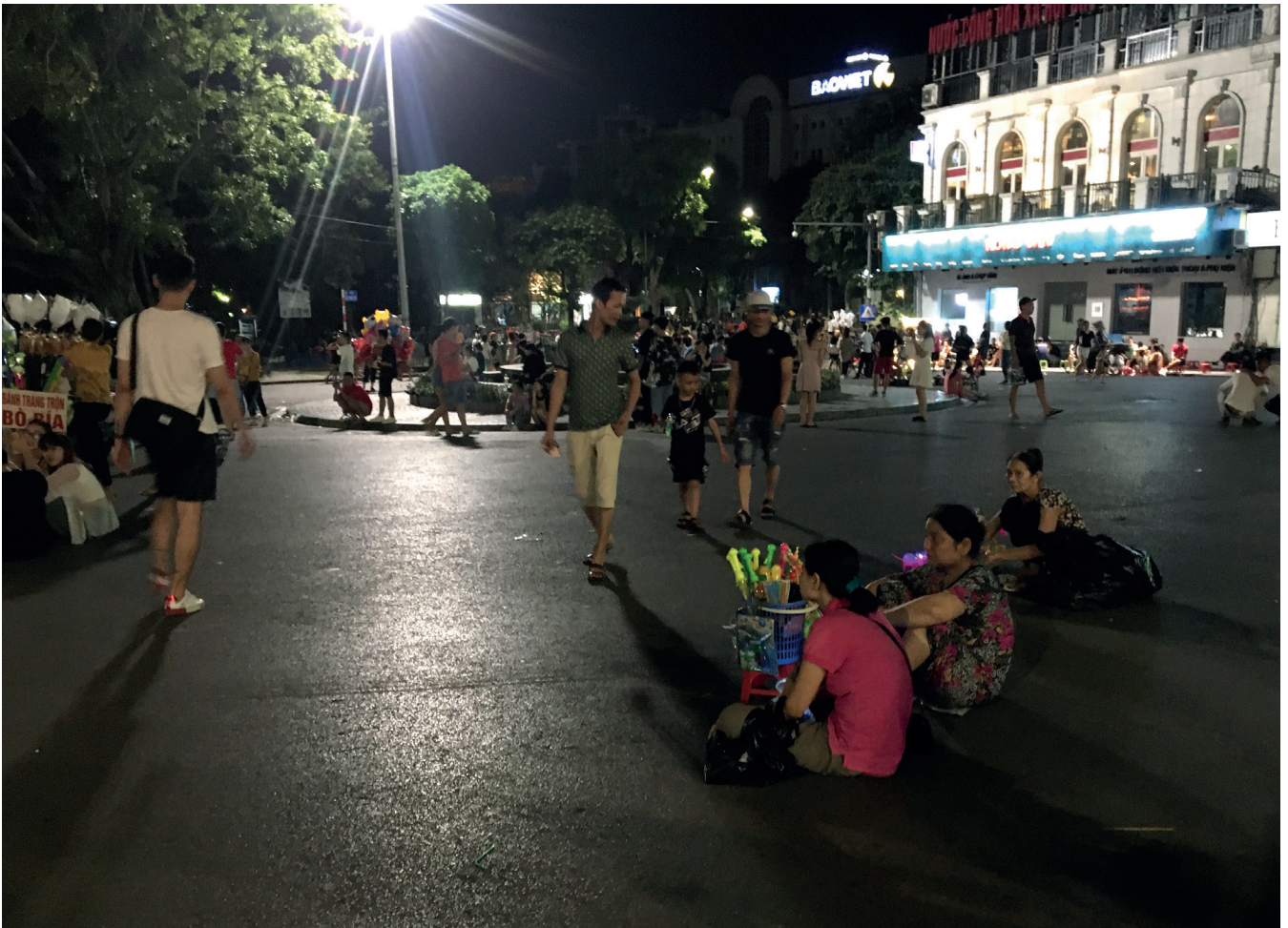
Figure 5: Itinerant vendors selling toys having a break together on Đông Kinh Nghĩa Thục.

more shade naturally lure more pedestrians and hence, more traders. During the evening, large streets like Đinh Tiên Hoàng become the venue for various activities and are packed with visitors and sellers. Despite the high density, there was always a certain distance between them to avoid conflict and minimize competition. These tactics were calculated and experimented thoroughly in order to maximize profit and improve productivity.