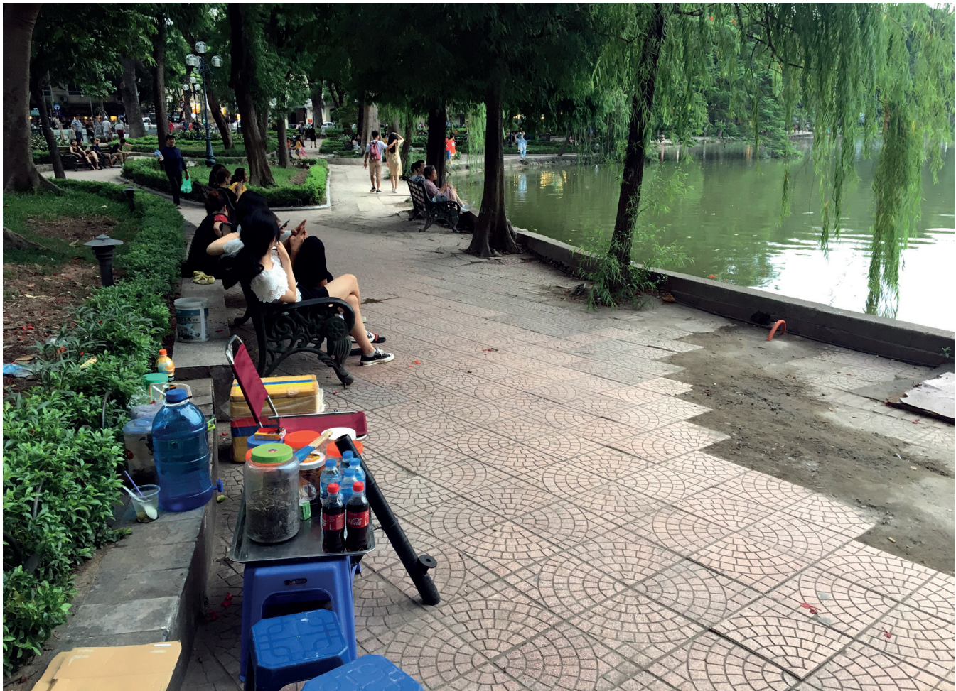
Figure 4: The guerrilla style of a tea stall setting up right next to benches around the lake.

ertheless, while it seems to many people that street vending is the last resort to secure their livelihoods, this type of work is also a choice for many others who pursue independence and flexibility (Truong 2017).