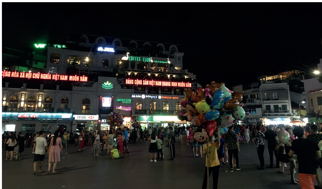
Figure 1: Đông Kinh Nghĩa Thục Square on a busy Friday night. “Long live the Social Republic of Vietnam - Long live the Vietnamese Communist Party” on the LED banner

study in this thesis was conducted during the COVID-19 pandemic, shortly after Vietnam ended the first national lockdown in 2020, during which no trading activities were allowed to operate. At the time of the field research, even though almost all restrictions had been lifted, the Vietnamese border remained close for international tourists. Hence, street vendors' lives were turned upside down and left with dreadful outcomes, like many other branches of the economy. Therefore, a part of this study is also dedicated to shedding a light on the informal sector during these difficult times.