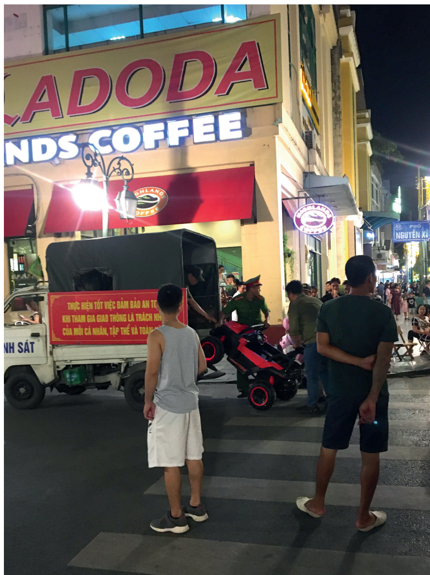
Figure 6: Local police confiscating electric toy cars on Trang Tien street during a sudden patrol.

The second reason for the decrease in income is visitors’ hesitance upon spending money in the WS. 28,2% of people asked said that they came to the WS less often after the lockdown, and 24,7% cut down on their consumption in this area. Despite the area being remarkably busy on some evenings, visitors were less likely to spend money on goods from street vendors. The reasons mentioned mainly touched on hygiene concerns and decreased income.