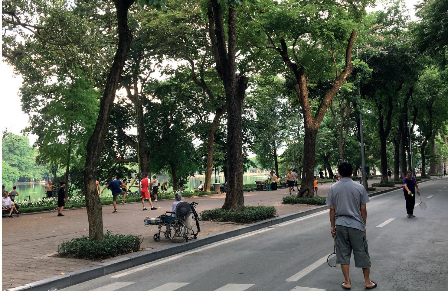
Figure 7: A section of the Walking Street with relatively low street vending activities on a Saturday afternoon.