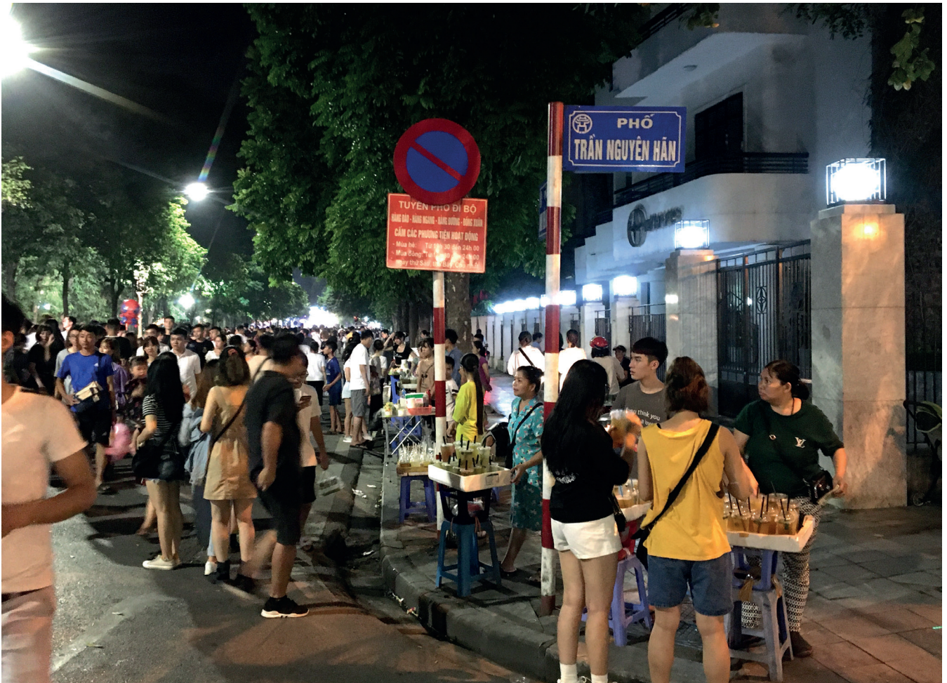
Figure 3: Vendors popping up like mushrooms after rain selling drinks and snacks on a scorching and crowded Saturday night.

control that “official efforts to obliterate unregulated activities through the proliferation of rules and controls often expand the very conditions that give rise to these activities” (Portes and Haller 2005). Without a formal regulation, the informal economy relies heavily on social ties by virtue of social networks or mutual trust. Under a socialist regime, where the state is deeply involved in the market, informal activities must be even more socially embedded to avoid malfeasance by business partners and to remain “underground”. In this kind of environment, solidarity bonds among partners are strengthened with the threat of state surveillance and repression (ibid.).