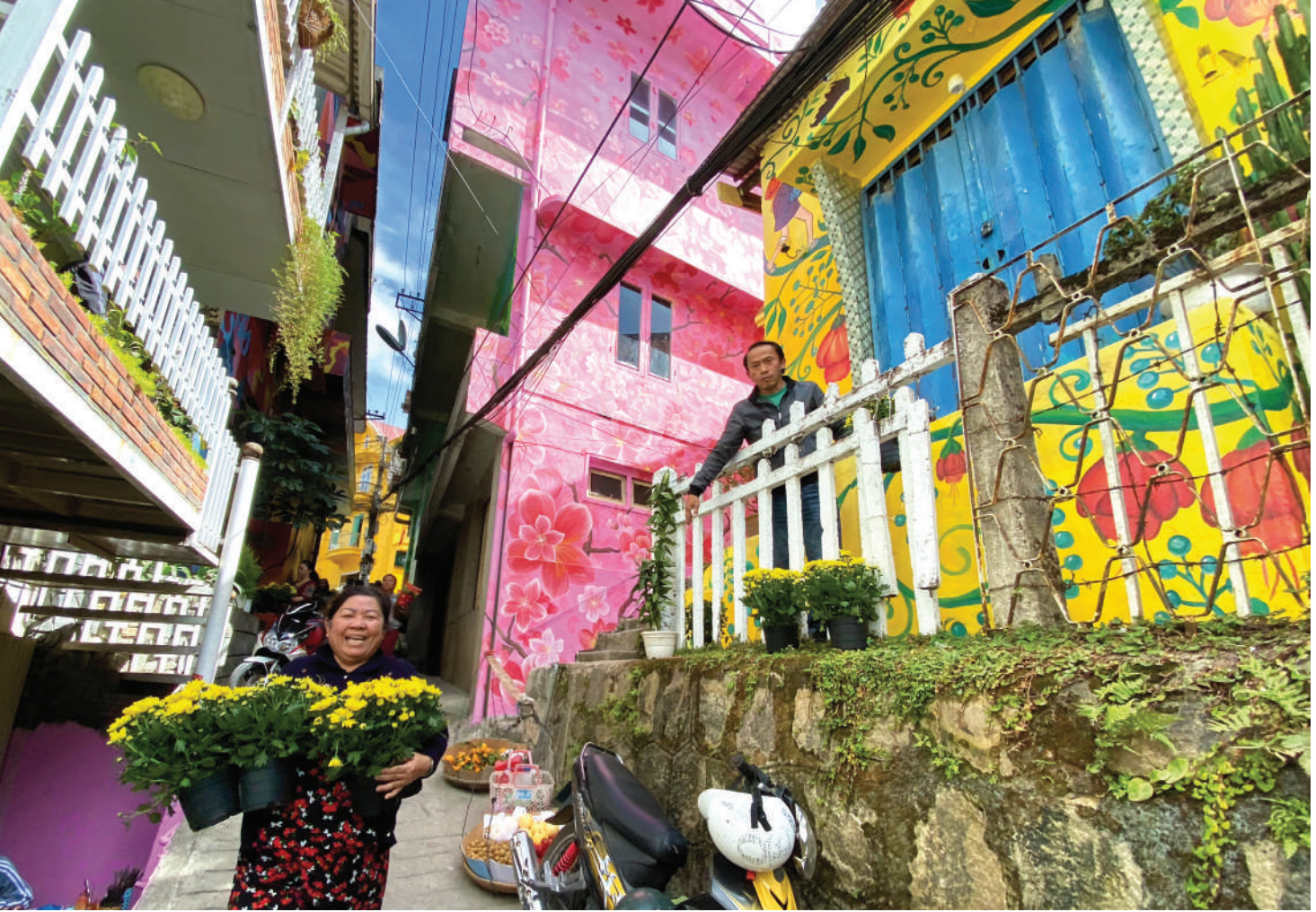
Figure 11: Bui Thi Xuan High school's girl – artists: Pinenip & Thanh Ngan Figure 12: Local people themselves plant more trees and flowers in their front yards and on balconies.