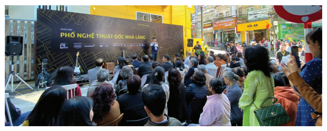
Figure 1: Impression from the opening event, 19 December 2019